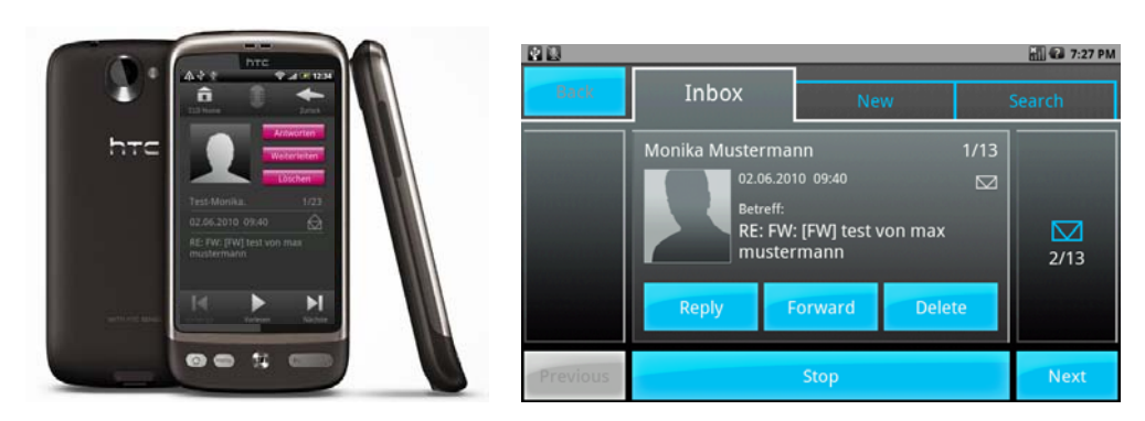
Figure 2: Smart phone and head unit interface of e-mail service

Of fundamental importance for the adaptation of services for in-car usage is the reduction of mental overload and driver distraction in order to avoid crash risk. Ongoing developments in speech recognition, speech-to-text and text-to-speech technology allow adapting the conventional, touch screen based HMI for in-car usage. Two different device classes have been targeted: the integration of a smart phone into the car and a head unit based approach. Figure 2 displays screenshots of both interfaces.